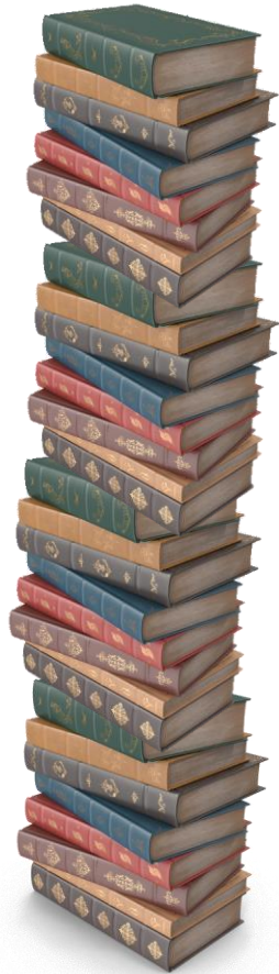
Student Textbook & Supplies Costs per year 1