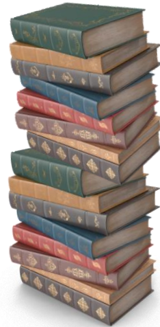
Student Textbook Costs per semester 2